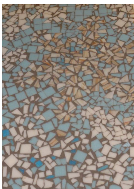
Mosaic Art Project: Nature Breaking Through